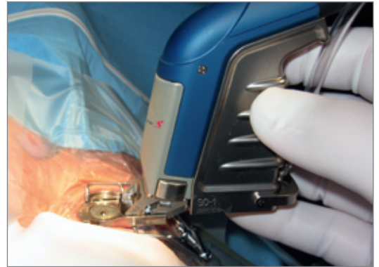
The AMADEUS handpiece is lightweight and easily controlled single-handedly. It gives the surgeon excellent visibility of the cornea during the procedure.

All important procedure parameters are programmable, allowing the surgeon to customize the microkeratome to his/her specific needs and preferences.