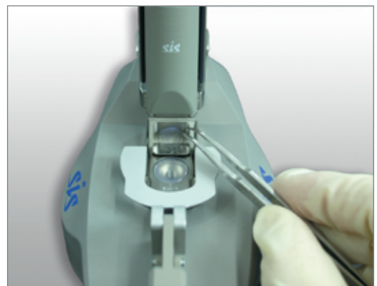
Preparation of a lamellar graft from a donor cornea.