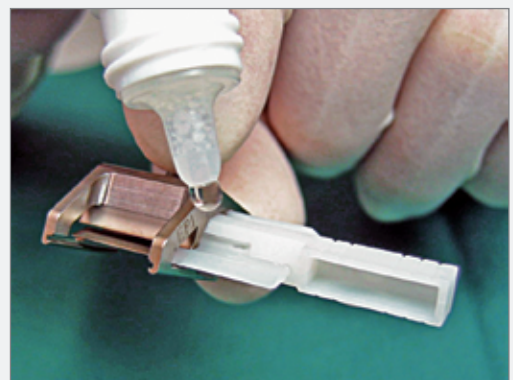
A SurePass Separator is being fitted into an epi-LASIK Blade Holder, to prepare the AMADEUS for an epi-LASIK procedure.

Standard parameters optimized for epi-LASIK are provided by system software. Optionally they may be customized according to surgeon preference.